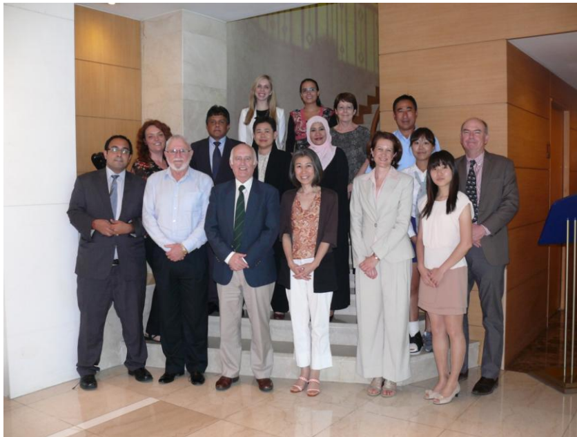
RAWS CG Meeting 6, Seoul, 26 August 2013