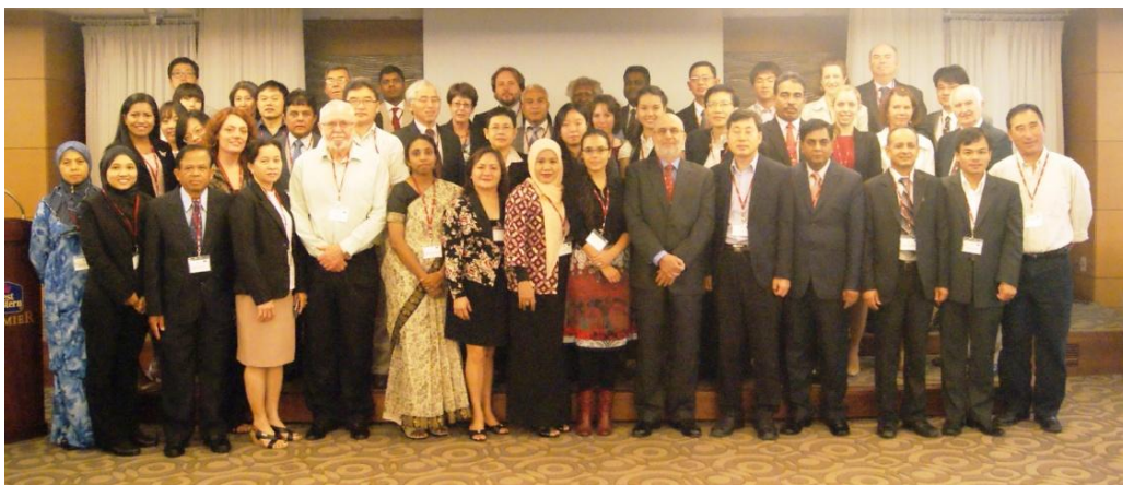
Above: Participants at the Regional Seminar for OIE National Focal Points for Animal Welfare in Seoul.

The Regional Seminar for OIE National Focal Points for Animal Welfare was held in Seoul, Republic of Korea from 27 to 29 August 2013. The seminar provided participants with knowledge about the rights, commitments and responsibilities of National Focal Points in the standard-setting process and compliance with OIE international standards. 51 participants attended, comprising National Focal Points from 30 member countries in the region, representatives from OIE Animal Welfare Working Group, OIE Collaborating Centre, an Animal Welfare NGO and livestock Industry from in the region, and observers from the host country, Korea. A number of presentations were made regarding animal welfare activity and achievements in the region, as well as the experience and future direction of the RAWS. These are available at- http://www.rr-asia.oie.int/activities/regional-programme/good-governance-of-veterinary-services/activities/2013-animal-welfare/presentation/