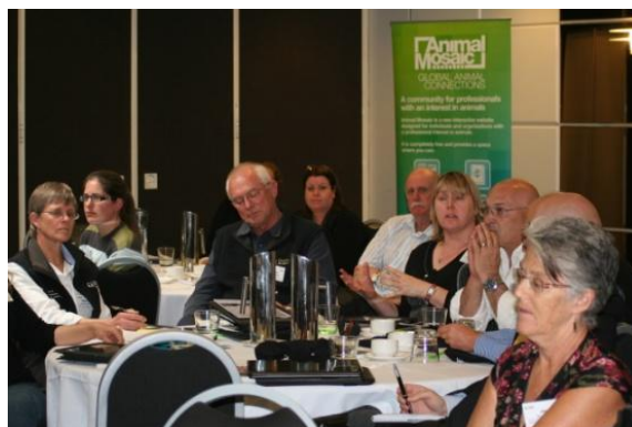
Photo: Delegates at the Advisory Committee for Animals in Emergencies.

http://www.australiananimalwelfare.com.au/content/pets-and-companion-animals/national-planning-principles-for-animals-in-disastersPCA