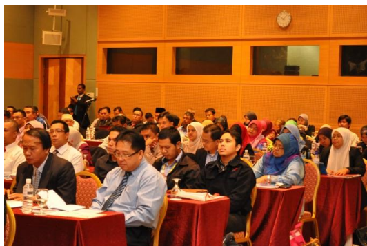
Above: Participants at the Colloquium on Animal Welfare and Well Being of Animals According to Islamic Perspectives