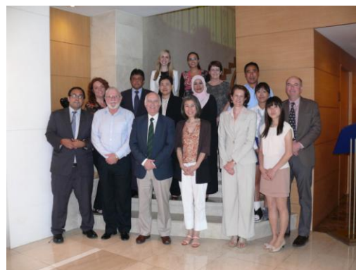
Photo: Participants at the 6 th RAWS CG meeting

The sixth meeting of the Regional Animal Welfare Strategy – Asia, the Far East and Oceania Coordination Group (RAWS CG) was held in Seoul, Republic of Korea on 26 August 2013, in conjunction with the Seminar for OIE National Focal Points for Animal Welfare held from 27 to 29 August 2013. At the meeting, RAWS CG members discussed and made recommendations relating to country/organisation progress and regulatory developments, the endorsement and publication of RAWS (edition 2), revisions to the RAWS Action Plan, the preparation of a paper for the Regional Commission meeting in November 2013, the status of existing projects and scope for new projects, and the interaction between the RAWS CG and national focal points for animal welfare. Many of these outcomes are outlined in the news updates below.